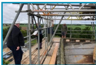
Photos of the Second Hard Hat Tour, New strengthening joints.