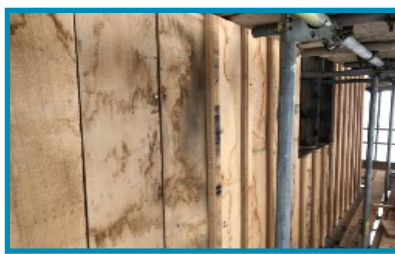
New oak planks on belfry New oak beams and joints.