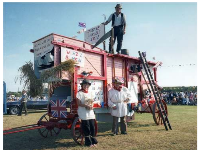
Silver Jubilee Carnival Float 1977