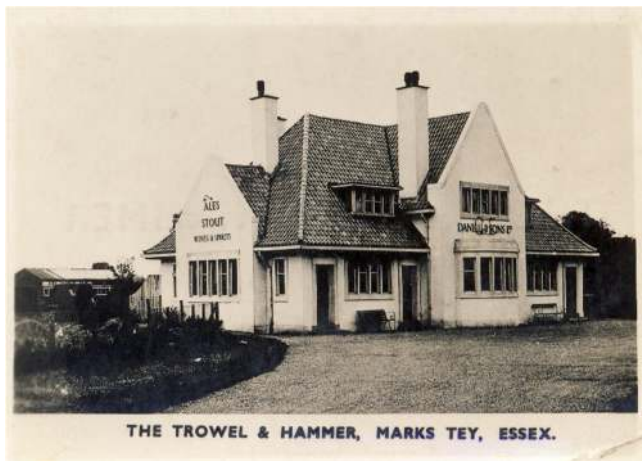
Later named The Spaniard, this pub was where the Shell Garage is now on the A12.

Although a large collection of photographs is held by our local historians it is very much hoped that more will come to light so that they can be copied for posterity.