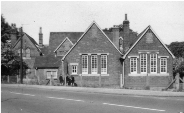
The old school was built in 1863. It was located between the Coggeshall Road roundabout and the shops. It was demolished for the A12

Although a large collection of photographs is held by our local historians it is very much hoped that more will come to light so that they can be copied for posterity.